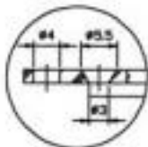
DETALHE "A" ESC. 3:1